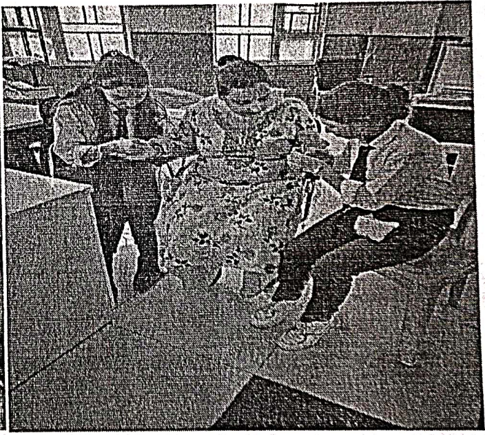
Fig.1. faculty members of Gautam College of pharmacy with mehndi applied by participating students